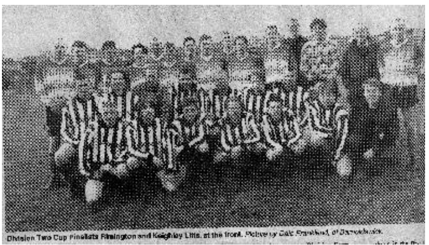
Craven Herald - April 1995