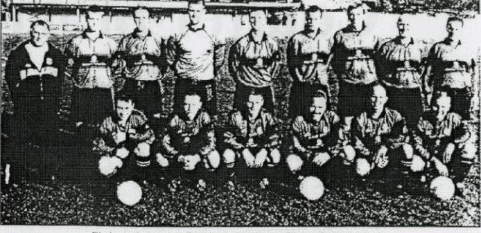
Rimington before their President's Cup Final at Shawbridge. (A040504/1)