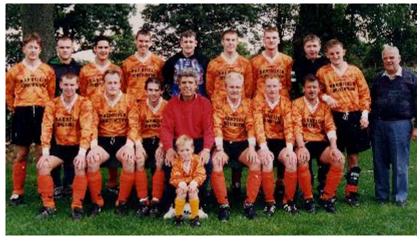
RIMINGTON FC 1995

2<sup>nd</sup> Team win the Craven League 1<sup>st</sup> Div Cup