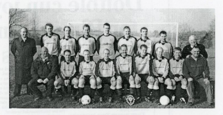
Rimington FC 2003-4 Presidents Cup & Craven Cup Winners

The locals then travel to Barnoldswick Town's West Close Road for the Craven Cup Final on Friday, May 7th, kick-off 6-30 p.m.