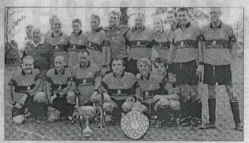
CUP JOY: Rimington FC recovered from a nightmare start to the season to win the league and cup double

their last of the season. In the cup, Rimming beat Settle in a quarter final replay then booked a place in the final with victory front of a crowd of around 100 against Grassington. The title race was hotting up and Rimington hit