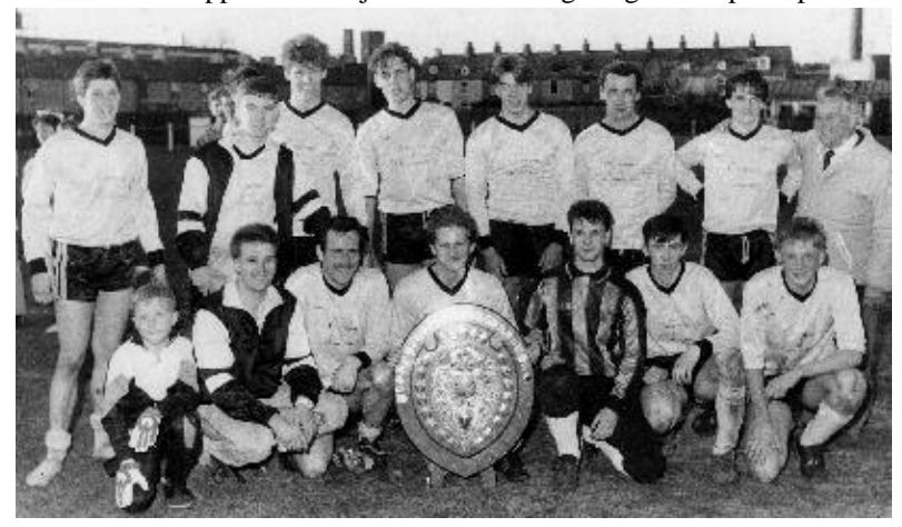
AITKEN SHIELD WINNERS FOR 2<sup>ND</sup> YEAR RUNNING - 1989

Application to join E. Lancs league agreed in principle