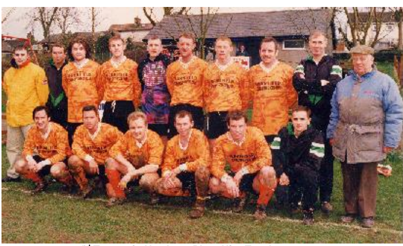
2<sup>nd</sup> Team win Northern Plant Hire Trophy Rimington FC 1<sup>st</sup> Team 1997/98

1st Team finish 3rd in Div1 E Lancs League its best ever position so far Another double whammy for 2<sup>nd</sup> Team!!!!!! 2<sup>nd</sup> Team win Div 1 of Craven League